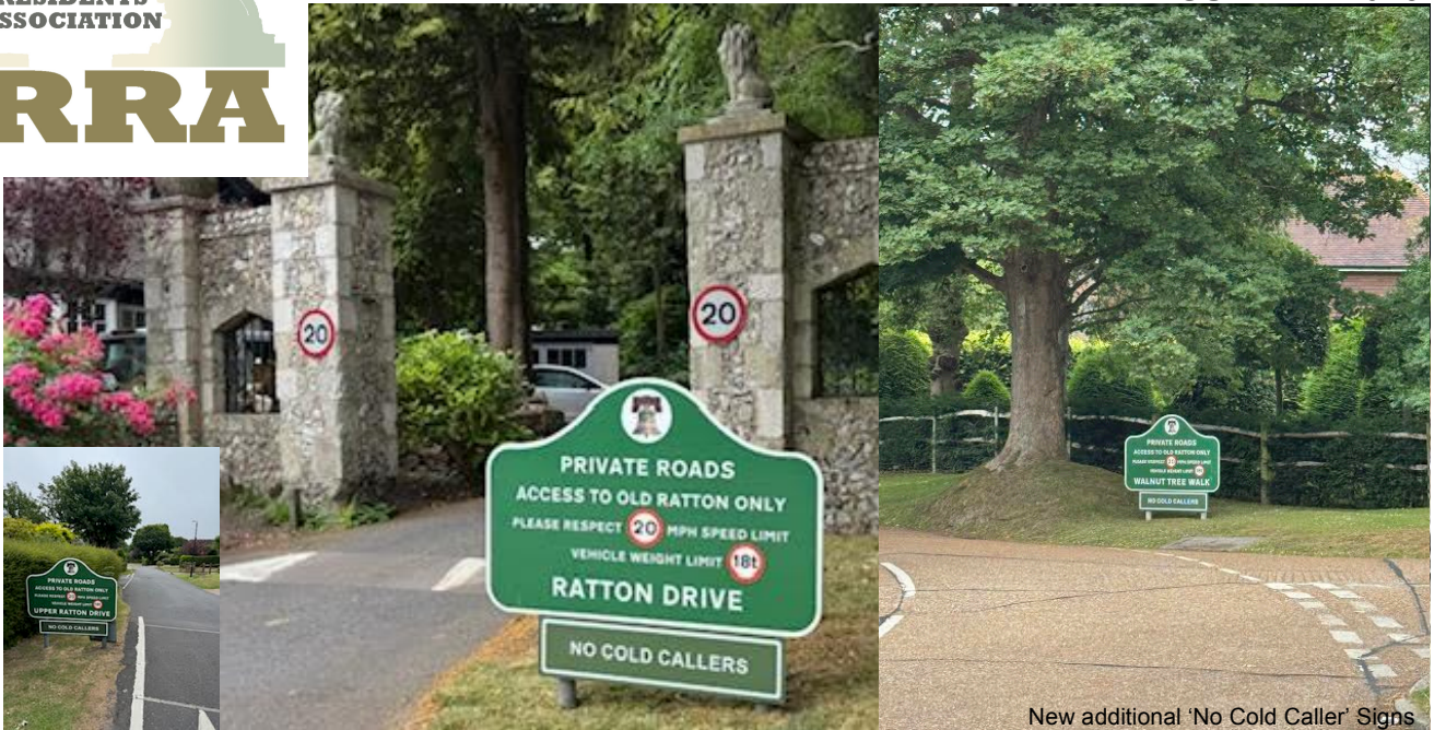
New additional 'No Cold Caller' Signs