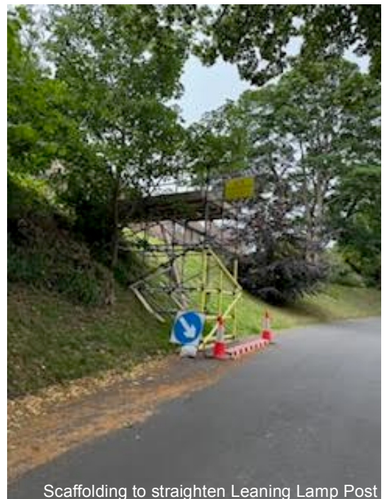
Scaffolding to straighten Leaning Lamp Post